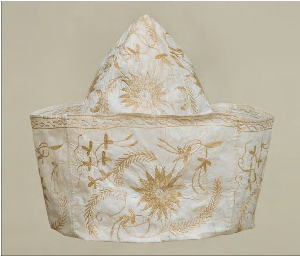
PAIR OF MEN'S UNDRESS CAPS English, early 18th century

Beneath the elaborate wigs that fashionable men wore from the mid-seventeenth to the late eighteenth century, their heads were usually shaved. While relaxing at home or entertaining intimate guests, an informal hat—called a nightcap or negligé cap in England—was worn in conjunction with a roomy wrapping gown in order to keep warm and to ornament the unsightliness of a shorn pate. Such garments were also permissible for public wear in popular spa towns, where the dress code was more informal than in London. In order to go unnoticed amongst the crowd at Bath, Joseph Addison donned “an embroidered Cap and Brocade Night-Gown,” in which “It was a great Jest to see such a grave ancient Person, as I am” ( The Guardian No. 174, 1713).