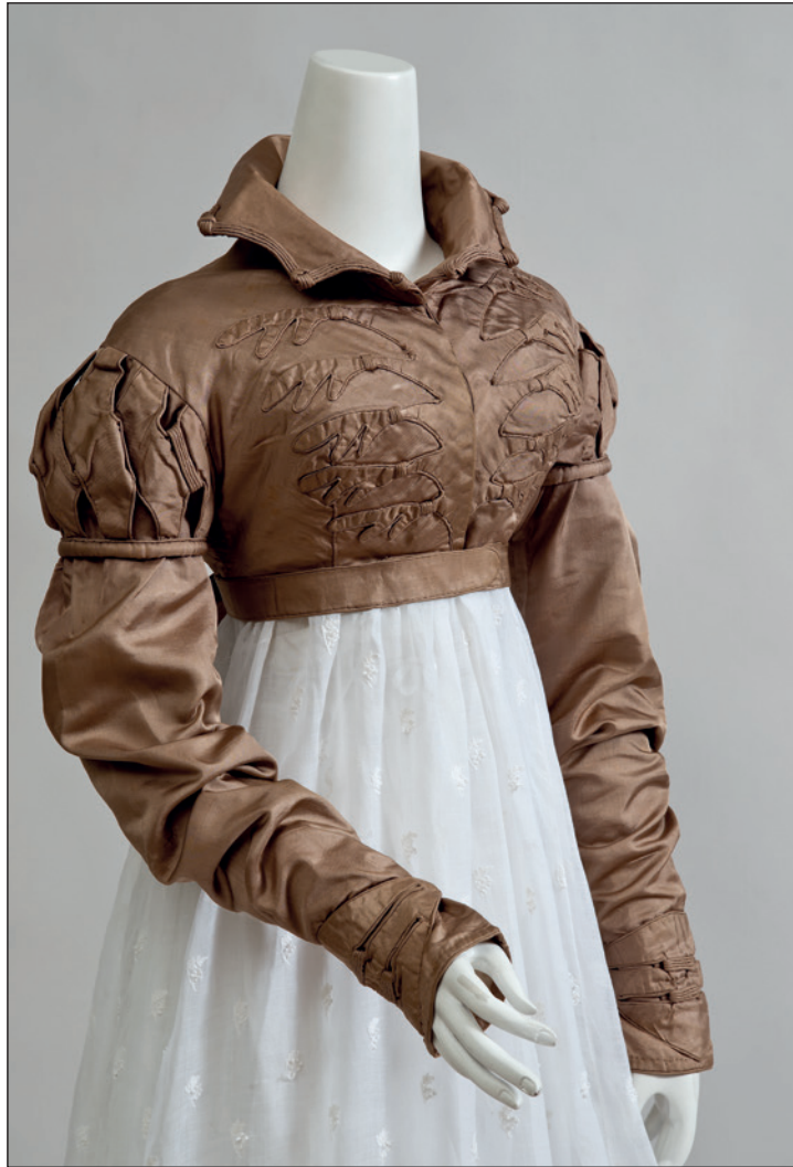
SILK SPENCER WITH SELF-FABRIC TRIM English, ca. 1820

At the turn of the nineteenth century, the change in the fashionable female silhouette introduced new forms of outerwear. For most of the previous century, voluminous capes and mantles worn over full-skirted gowns supported by panniers offered protection from cold and inclement weather. The slender, columnar shape that characterized the late 1790s and first decades of the nineteenth century allowed for the adoption of tight-fitting outer garments such as the spencer, often worn over light muslin dresses. Named after George, 2nd Earl Spencer (1758-1834), who is reputed to have set the vogue for these short jackets, the spencer was a mainstay of women's wardrobes from the mid-1790s through the mid-1820s. Often featured in fashion periodicals of the time, spencers were made in silk, wool, and cotton, depending on the season, and trimmed with a variety of materials such as self-fabric, braid, tassels, velvet, and fur.